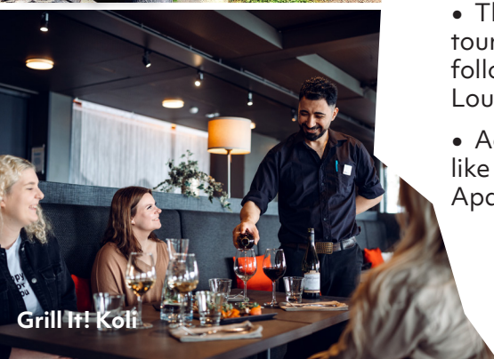
Grill Tt! Koli